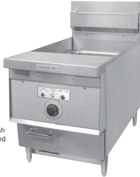
One pair 4 mesh baskets included

The 14 CMBB E Counter Model Fryer is ideal for multi-product use. The 14 CMBB E allows you to cook up to 72 lbs. of frozen french fries per hour with an input of 15.5 kW rated at 240 volts.