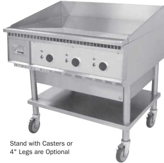
Stand with Casters or 4" Legs are Optional

The Keating MIRACLEAN® Griddle is designed to provide maximum performance with many benefits to the operator. The mirror surface is achieved in a special eight step process. Insulated stainless steel electric elements are mounted every 12" to ensure performance and recovery allowing the operator to use zone cooking for different products.