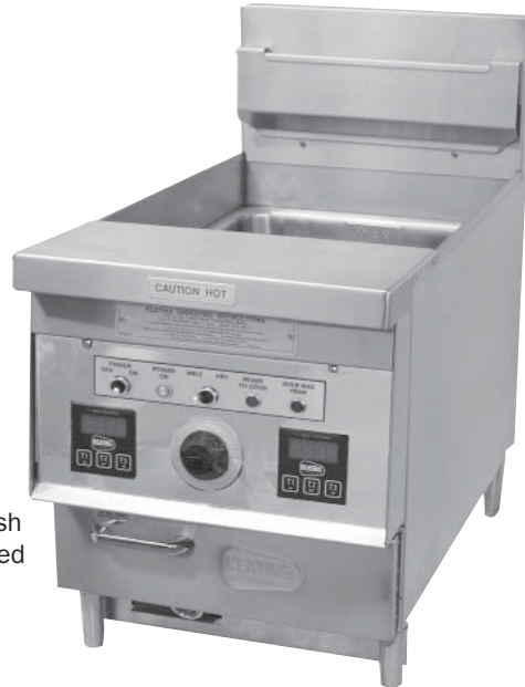
One pair 4 mesh baskets included

The 10x11 CMTS Electric Counter Model Fryer is ideal for multi-product use.