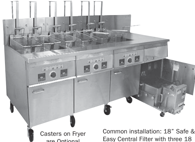
Casters on Fryer are Optional