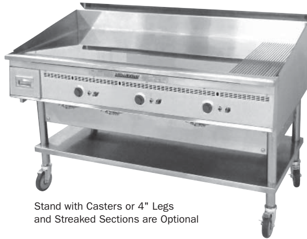
Stand with Casters or 4" Legs and Streaked Sections are Optional

The Keating MIRACLEAN® Griddle is designed to provide maximum performance with many benefits to the operator. The mirror surface is achieved in a special eight step process. High input burners rated at 30,000 BTU/hr. for natural gas are mounted every 12" to ensure performance and recovery allowing the operator to use zone cooking for different products.