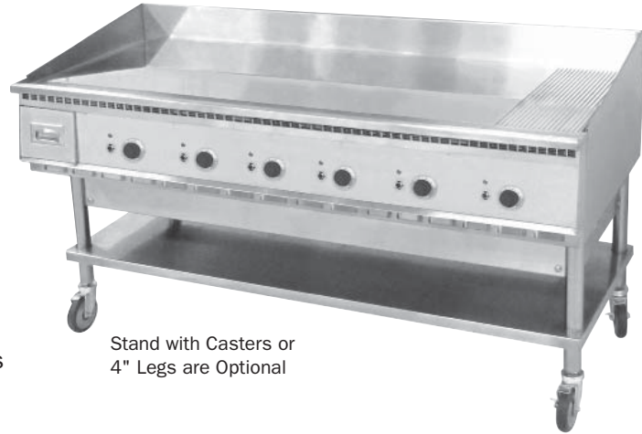
Stand with Casters or 4" Legs are Optional

The Keating MIRACLEAN® Griddle is designed to provide maximum performance with many benefits to the operator. The mirror surface is achieved in a special eight step process. Insulated stainless steel electric elements are mounted every 12" to ensure performance and recovery allowing the operator to use zone cooking for different products.