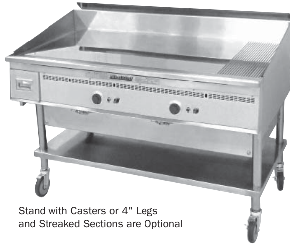
Stand with Casters or 4" Legs and Streaked Sections are Optional

The Keating MIRACLEAN® Griddle is designed to provide maximum performance with many benefits to the operator. The mirror surface is achieved in a special eight step process. High input burners rated at 30,000 BTU/hr. for natural gas are mounted every 12" to ensure performance and recovery allowing the operator to use zone cooking for different products.