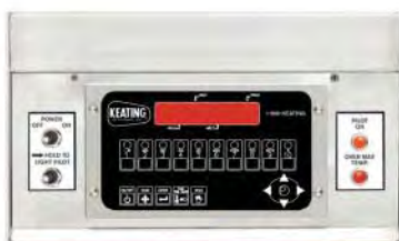
CPU Control Panel