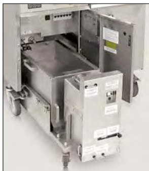
Safe & Easy® Under Fryer Filter

Model TS is available in gas and electric, with many standard features that save time & money - the 24 TS G can cook up to 200 lbs. of french fries per hour. Includes a Heat-On light, Over Max Temp safety light, and 2 solid state timers.