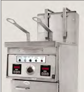
14" TS Fryer shown with Basket-Lift option

From 10" x 11" counter models to battered installations of 34" x 24" units, in natural gas, LP and electric, there is an Instant Recovery® Fryer that is right for your operation. The many options include casters, extended fronts, stainless steel sides, drainboards and oversized drains on 18" and larger units. Computerized controls and basket-lifts are available on TS Models. Common gas manifolds for battered fryers reduce connections and simplify installation. Three filtering systems, Safe & Easy® Under Fryer, Safe & Easy® Central, or our Portable Filter are available for Keating Instant Recovery® Fryers.