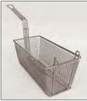
Two split baskets are included with Keating fryers