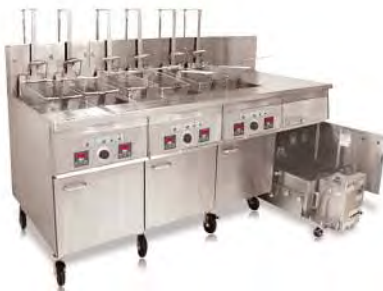
Safe & Easy® Central Filter shown with three 18" TS Fryers